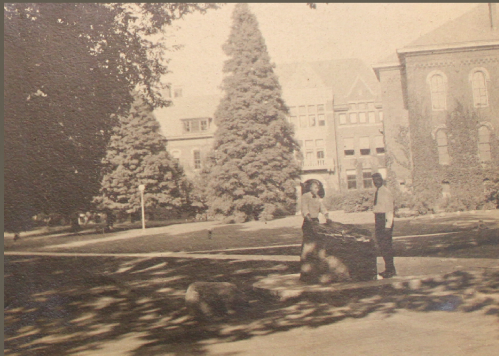
Old drinking fountain with natural history building in the background